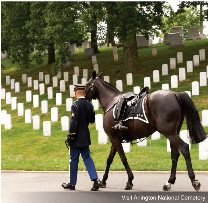
Visit Arlington National Cemetery