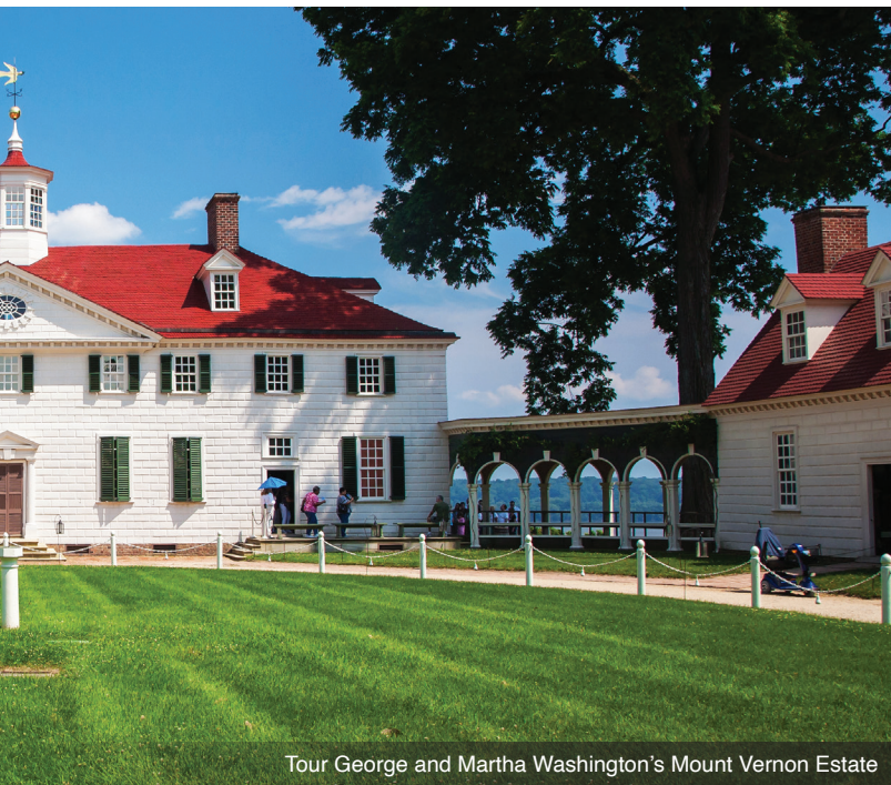
Tour George and Martha Washington's Mount Vernon Estate

Lincoln and George Washington. Later, stop at the boyhood home of George Washington, Ferry Farm where the family moved to in 1738. Meals: B, L