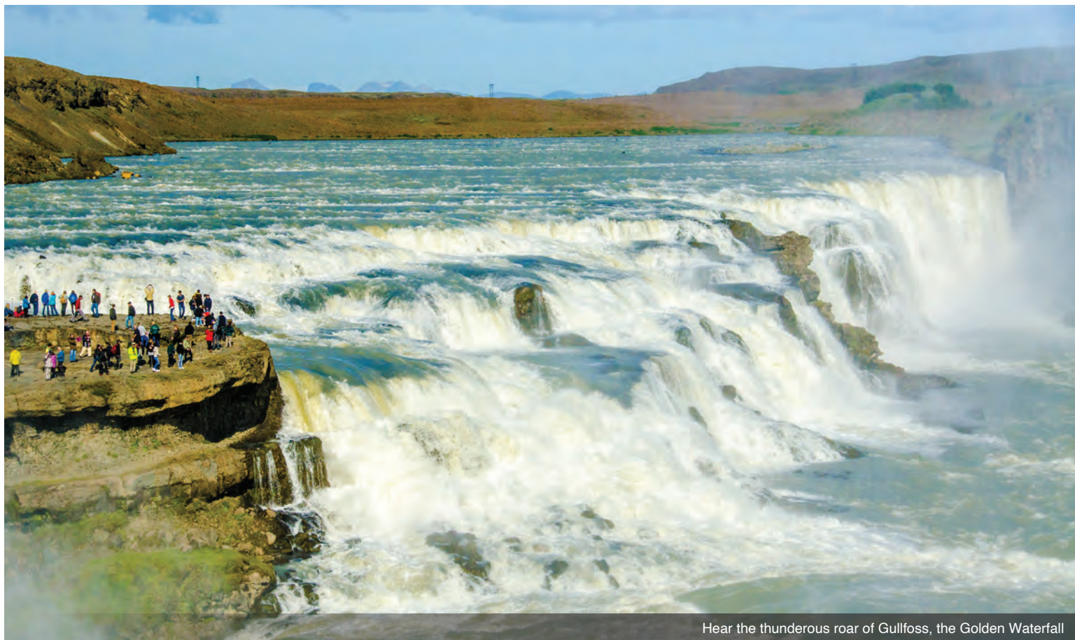
Hear the thunderous roar of Gullfoss, the Golden Waterfall