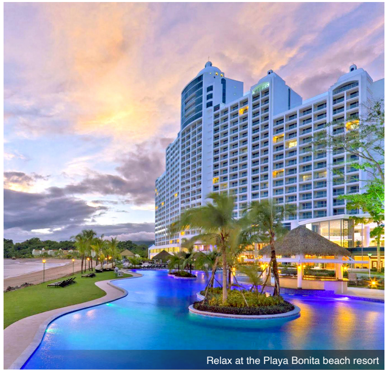
Relax at the Playa Bonita beach resort

DAY 4 Panama City – Playa Bonita: Depart the city and journey by coach to La Playa Bonita beach area. Enjoy the next three nights in the relaxed atmosphere of the resort. Meal: B