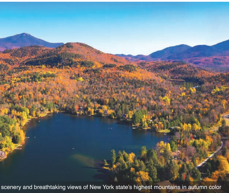
scenery and breathtaking views of New York state's highest mountains in autumn color