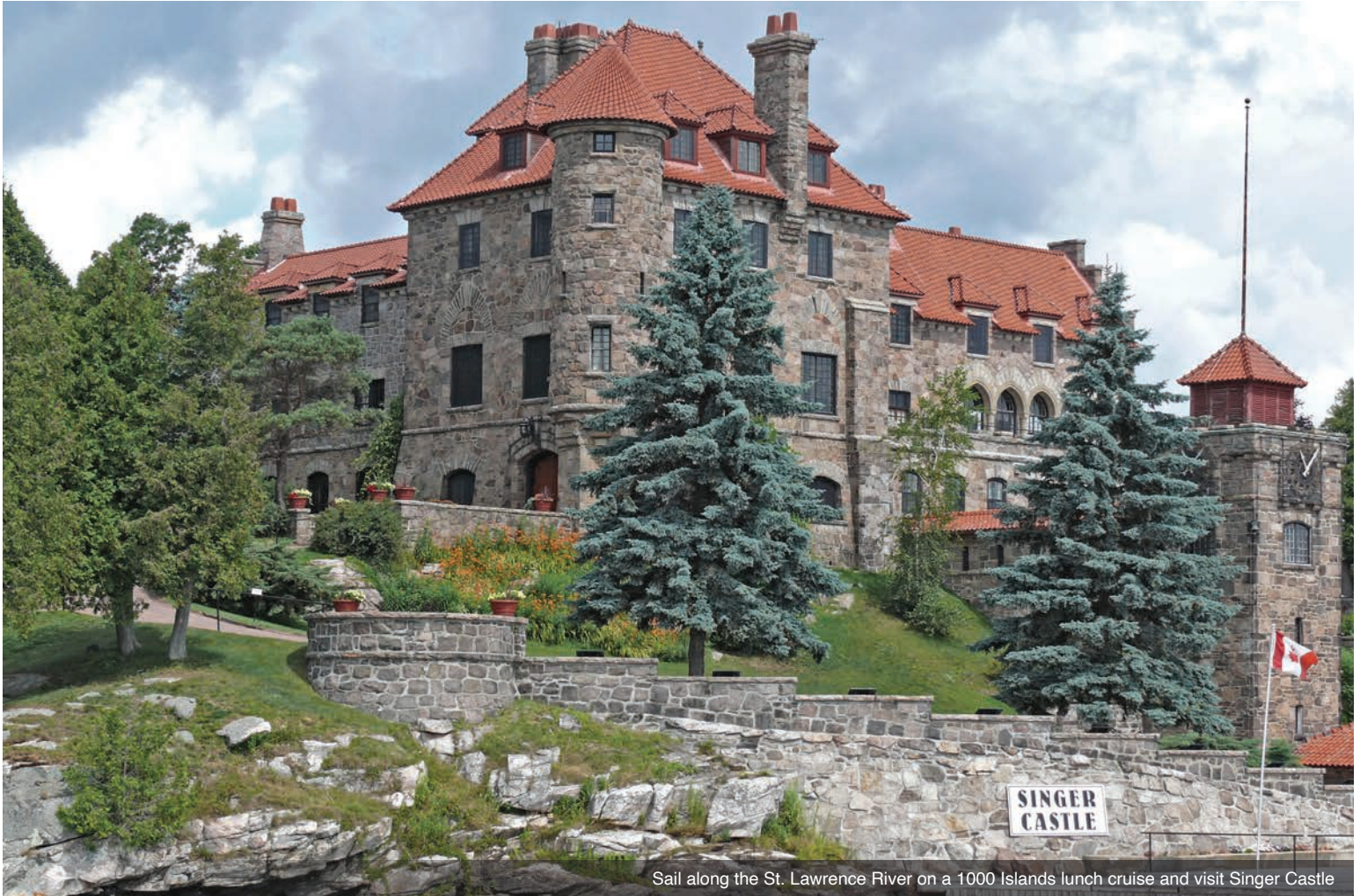
Sail along the St. Lawrence River on a 1000 Islands lunch cruise and visit Singer Castle