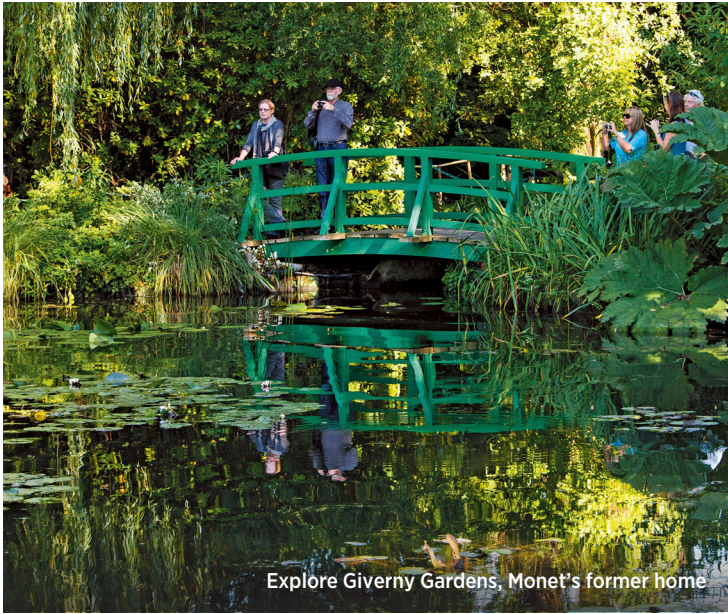
Explore Giverny Gardens, Monet's former home

landed, as well as the memorials and museum, which honor the bravery of those involved and their ultimate sacrifice. Your Star-Ship remains docked in Honfleur overnight. Meals: B, L, D