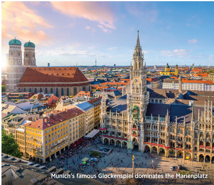
Munich's famous Glockenspiel dominates the Marienplatz

example of Baroque architecture and home to Europe's largest pipe organ with more than 17,000 pipes. After a bit of free time, return to the ship for a leisurely sailing along the river to Regensburg.