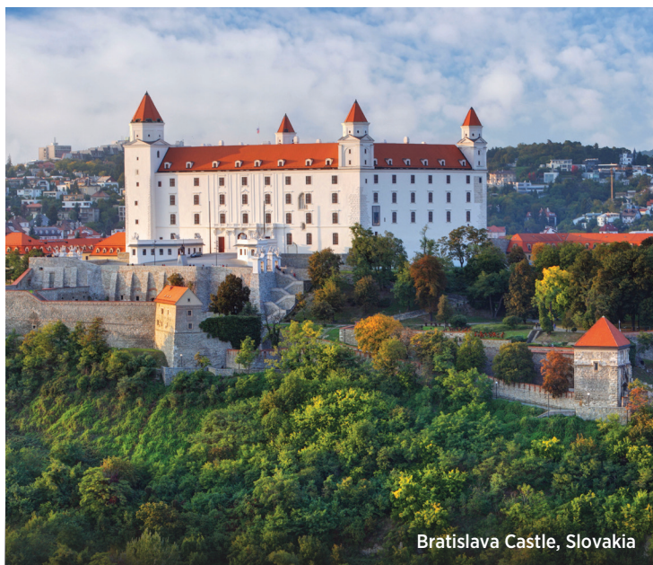
Bratislava Castle, Slovakia

Today's included tour presents you with a fantastic opportunity to become acquainted with Hungary's beautiful capital. See the Hungarian Parliament Building, Heroes' Square, and Andrássy Avenue – a UNESCO World Heritage Site. Alternatively, enjoy a guided hike to Gellert Hill for a postcard-worthy panorama of the Danube banks. This afternoon, the ship departs for Bratislava. Meals: B, L, D