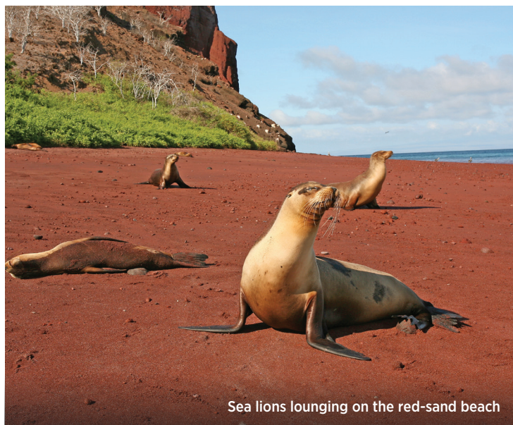
Sea lions lounging on the red-sand beach

After breakfast, enjoy a guided tour of Quito. The first city to be named a UNESCO World Heritage Site in 1978, Quito boasts a historic center and centuries-old landmarks, dating back 500 years. See Independence Square, flanked by Presidential and Archbishop's palaces. Visit 'Mitad del Mundo' and the Equator Monument, which stands at 0 degrees, and feel what it's like to be standing in the middle of the world. During the included city tour, see a bull fighting ring and the gilded Spanish colonial church. This evening, enjoy the city on your own. Meals: B, L