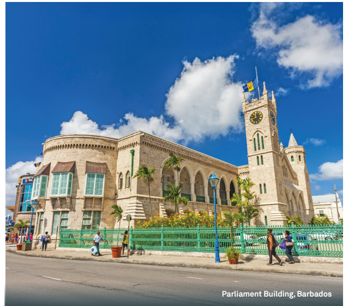
Parliament Building, Barbados

or simply unwind on a pristine stretch of beach with a cocktail in hand.