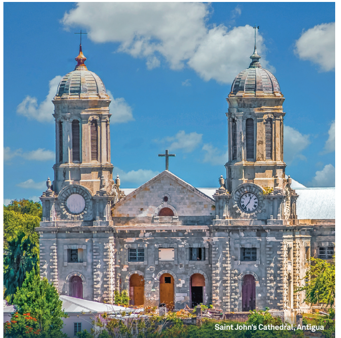
Saint John's Cathedral, Antigua

The itinerary is a guide only and may be amended for operational reasons. As such Mayflower & Scenic cannot guarantee the tour will operate unaltered from the itinerary stated above. Please refer to our terms and conditions for further information. #Spa treatments at additional cost. +All drinks on board, including those stocked in your mini bar, are included, except for a very small number of rare, fine and vintage wines, Champagnes and spirits. Specialty restaurants require a reservation, enquire on board. ^Flights on board our two helicopters are at additional cost, subject to regulatory approval, availability, weight restrictions, medical approval and weather conditions. Submersible not operational on this departure.