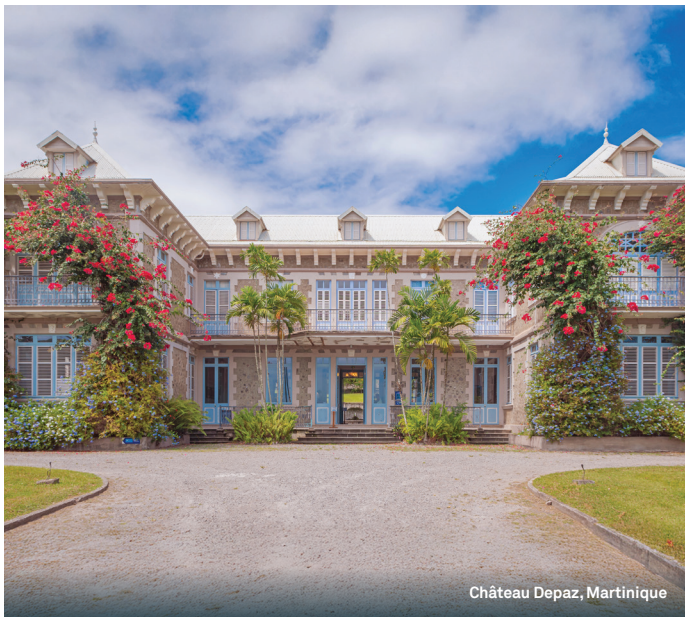
Château Depaz, Martinique