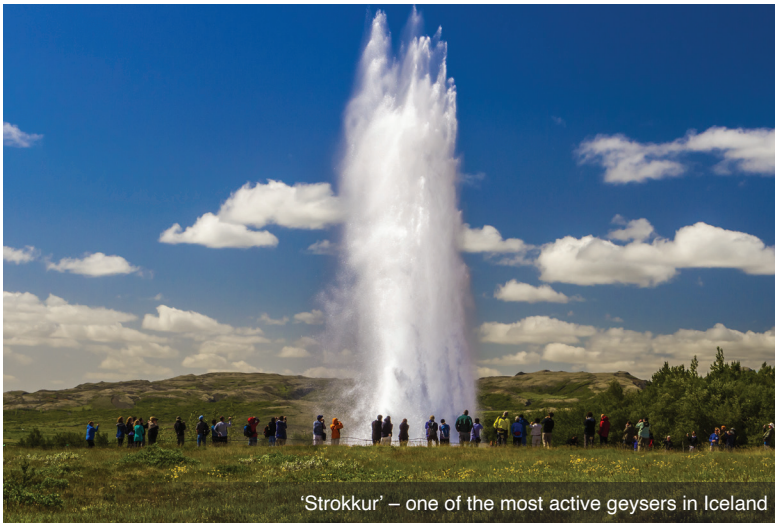
'Strokkur' – one of the most active geysers in Iceland

Enjoy free time for lunch on your own and shopping, then prepare to “take off” as you visit FlyOver Iceland. During this virtual flight, experience waterfalls, geysers, scenic landscapes, and the spectacular natural wonders of Iceland like never before. With the special effects of motion, wind, sound and scents, this unique “flying” experience is sure to be a highlight of your day! Return to the hotel late afternoon for an evening at leisure. Meal: B