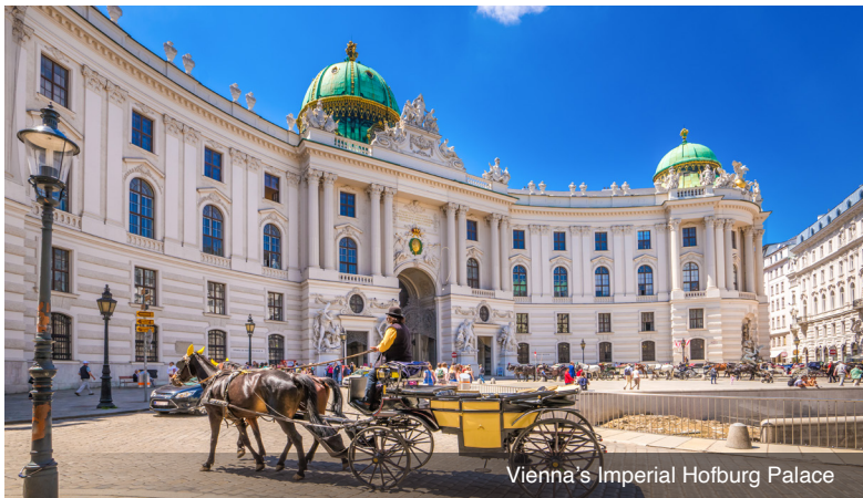
Vienna's Imperial Hofburg Palace

DAY 9 Bratislava, Slovakia: Today you sail into the capital of Slovakia. This graceful nation became an independent country in 1993, and since then, Bratislava has flourished as a new capital and made a name for itself as a cultural center. The romantic cobblestone lanes that weave through the city are explored with your local guide as you enjoy a walking tour of the ancient town center, seeing the Slovak National Theatre and a range of Gothic and Art Nouveau buildings. For the more active guests, embark on a guided hike to Bratislava Castle, a landmark steeped in legends that looks as though it came from the pages of a fairytale book. Meals: B, L, D EmeraldACTIVE: A guided hike to Bratislava Castle (instead of walking tour) DiscoverMORE: Carpathian Wine Route (additional expense) EmeraldPLUS: Local Slovakian entertainment onboard DiscoverMORE: Skoda tour of post-Communist Bratislava (additional expense)