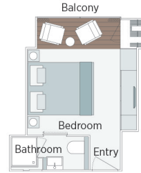
Panorama Balcony Suite