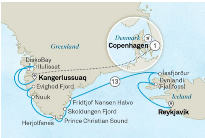
— Cruise 📍 Cruise start/finish ① Overnight stay

Glaciers calving, rivers flowing, towering rock walls and colourful forests - the Skjoldungen Fjord is spectacular. Look up to admire huge crevasses and freestanding pillars of ice standing silhouetted against the blue Greenland sky. On the lower slopes, Arctic wildflowers will bloom amongst the dwarf birch and willow trees. Join the Discovery Team on the Observation Deck as nimble Scenic Eclipse weaves through numerous icebergs in this narrow channel and learn about the archaeological remains that have been found in this region, suggesting people lived here over 4,000 years ago. Meals: B. L. D.