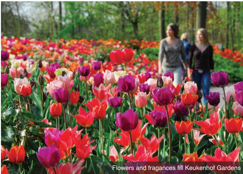
Flowers and fragrances fill Keukenhof Gardens

DiscoverMORE: Moselle & Cochem (Reichsburg) Castle Visit (additional expense)