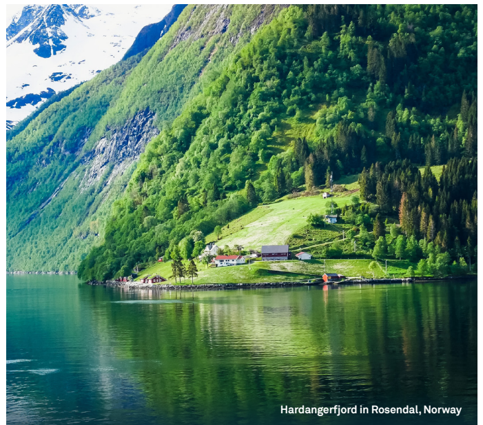
Hardangerfjord in Rosendal, Norway

Arrive this morning in Norway's second largest city, the Hanseatic fishing port of Bergen, which dates back to the 12th century. Surrounded by seven hills, it's considered one of the prettiest cities in Norway