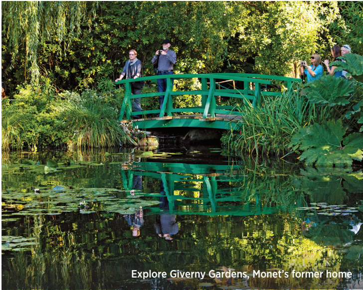
Explore Giverny Gardens, Monet's former home

As Honfleur is also renowned for its premium fresh seafood, your tour includes a fresh oyster tasting – savouring authentic local flavours.