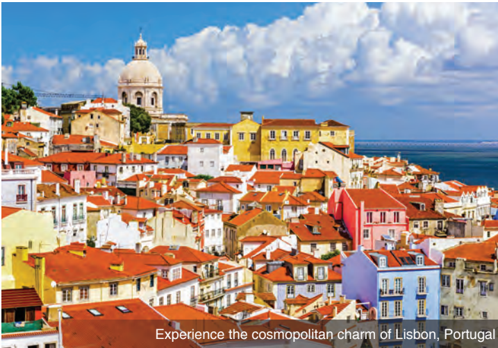
Experience the cosmopolitan charm of Lisbon, Portugal