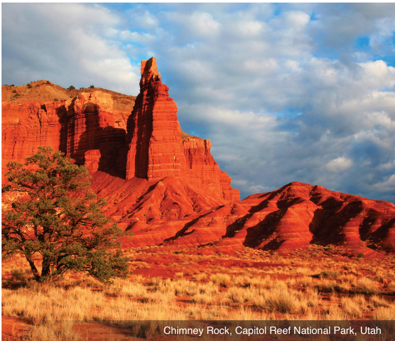
Chimney Rock, Capitol Reef National Park, Utah

DAY 10 Balloon Fiesta Mass Ascension and Evening Balloon Glow: It's an early start today at the Fiesta Grounds for the "mass ascension" of over 600 specially shaped balloons as they lift off at sunrise. Later a local guide joins you for a tour of Albuquerque to learn about the history of the area. Just before dusk, the burners of nearly 500 balloons are ignited and the evening sky fills with a kaleidoscope of brilliant, luminous color at the Balloon Glow. Meal: B