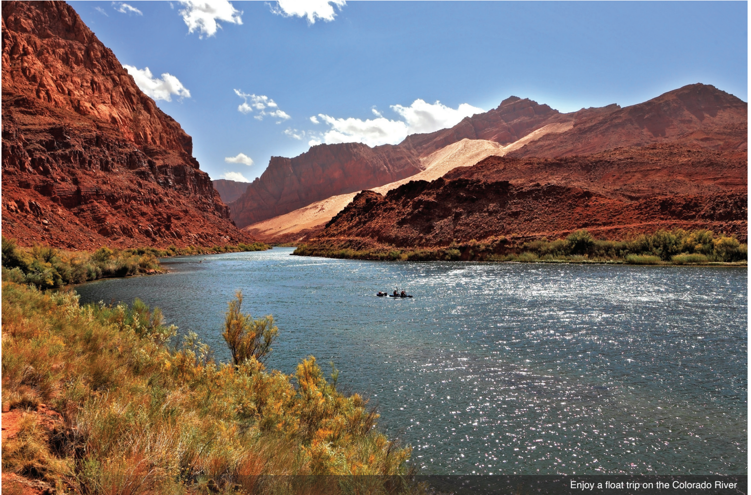
Enjoy a float trip on the Colorado River