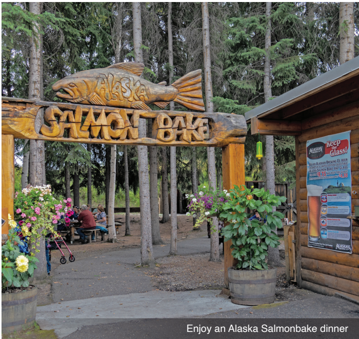
Enjoy an Alaska Salmonbake dinner

DAY 1 Fly to Fairbanks: Your flight to the “Land of the Midnight Sun” takes you to Fairbanks, Alaska, where your Tour Manager greets you at the hotel. The first day of travel will come to a quiet close as you explore the new surroundings and prepare for your adventure.