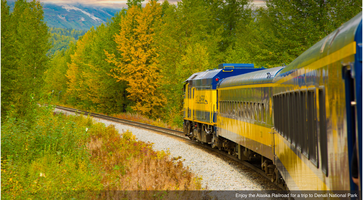
Enjoy the Alaska Railroad for a trip to Denali National Park