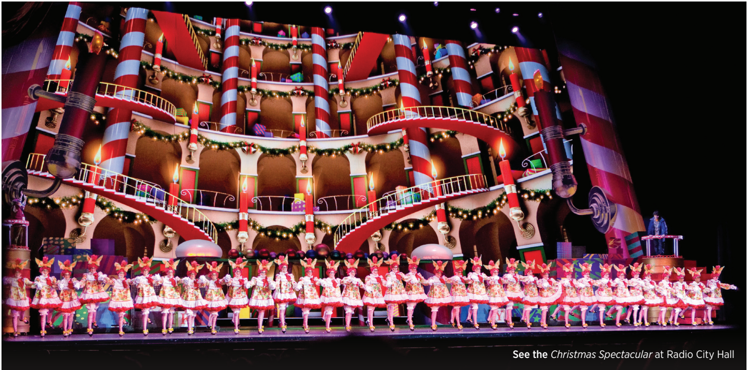
See the Christmas Spectacular at Radio City Hall

As traditional as family gatherings, turkey feasts and football games on Thanksgiving Day is the annual Macy's Thanksgiving Day Parade. This extravaganza features a host of clowns, floats, marching bands, celebrities and the famous gigantic balloons that follow the parade overhead. In the evening, gather with your fellow traveling companions for a special farewell dinner hosted by your Tour Manager. Meals: B, D