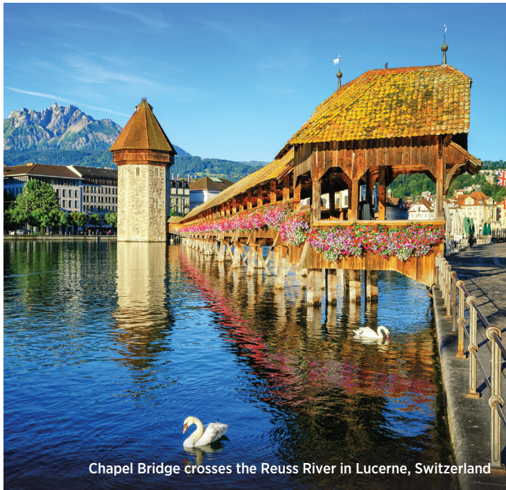
Chapel Bridge crosses the Reuss River in Lucerne, Switzerland