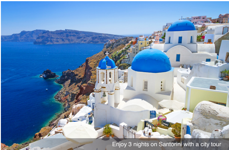
Enjoy 3 nights on Santorini with a city tour

DAY 10 Veria / Vergina / Thessaloniki: This morning, depart for Veria, a town well-known for its religious history due to the preaching of St. Paul. See the Byzantine and post-Byzantine churches and stroll through the old quarters, of which the Jewish and Christian are the most famous to have survived. Continue to Vergina, the first capital of Ancient Macedonia, for a visit to the new Polycentric Museum of Aigai. This museum houses changing exhibits and a permanent collection of sculptures. See the stunning veiled marble statue of Queen Eurydice I of Macedon, who was “the woman who changed history”. Visit the Royal Tombs of Vergina, an underground museum housing the burial cluster of Philip II, father of Alexander the Great; Philip III of Macedon, Alexander the Great’s half-brother; and Philip IV of Macedon, Alexander the Great’s son. See the extraordinary golden treasures dating back to the 4th century B.C., and other burial items. Return to Thessaloniki for some free time before the farewell dinner. Meals: B, D