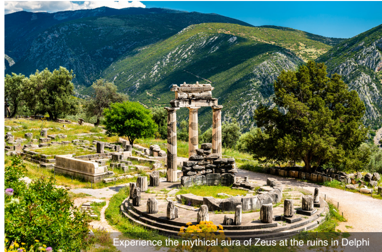
Experience the mythical aura of Zeus at the ruins in Delphi

DAY 1 Depart the USA: Depart the USA on your overnight flight to Athens, Greece.