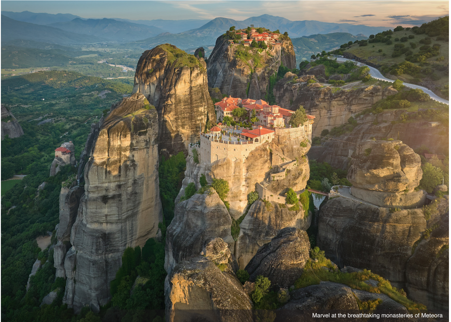
Marvel at the breathtaking monasteries of Meteora