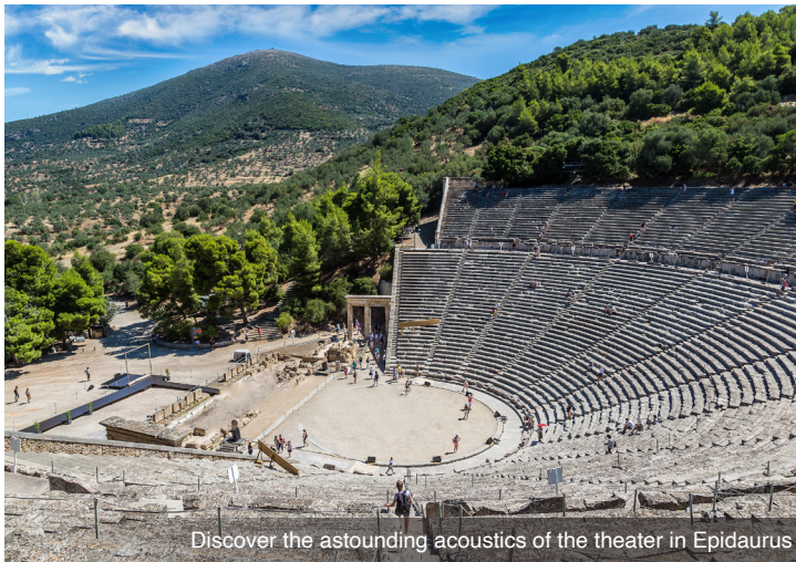
Discover the astounding acoustics of the theater in Epidaurus