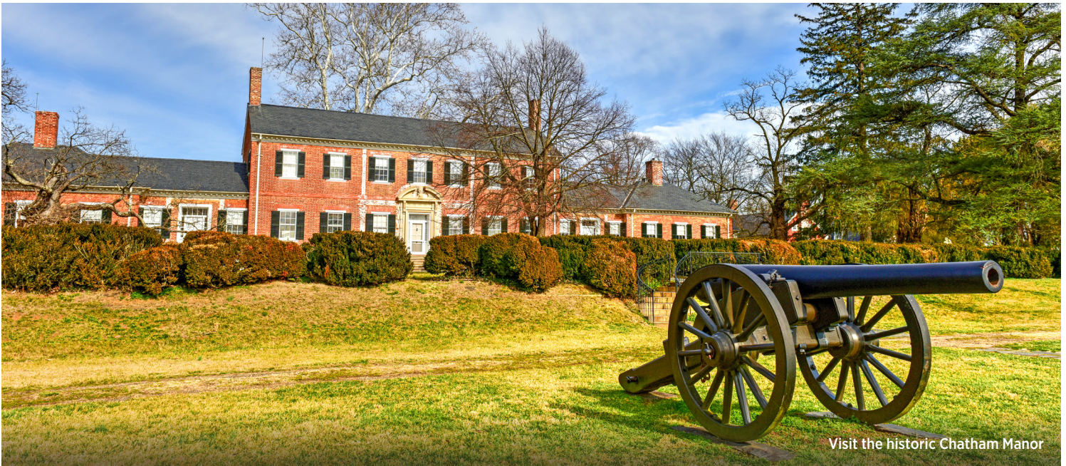
Visit the historic Chatham Manor