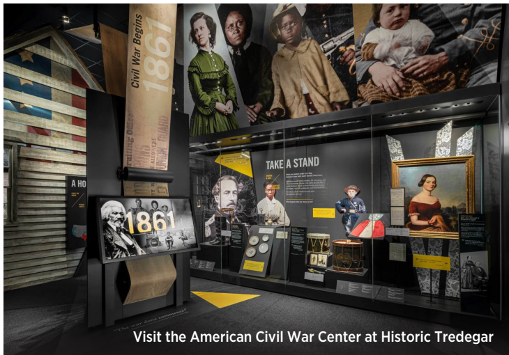
Visit the American Civil War Center at Historic Tredegar