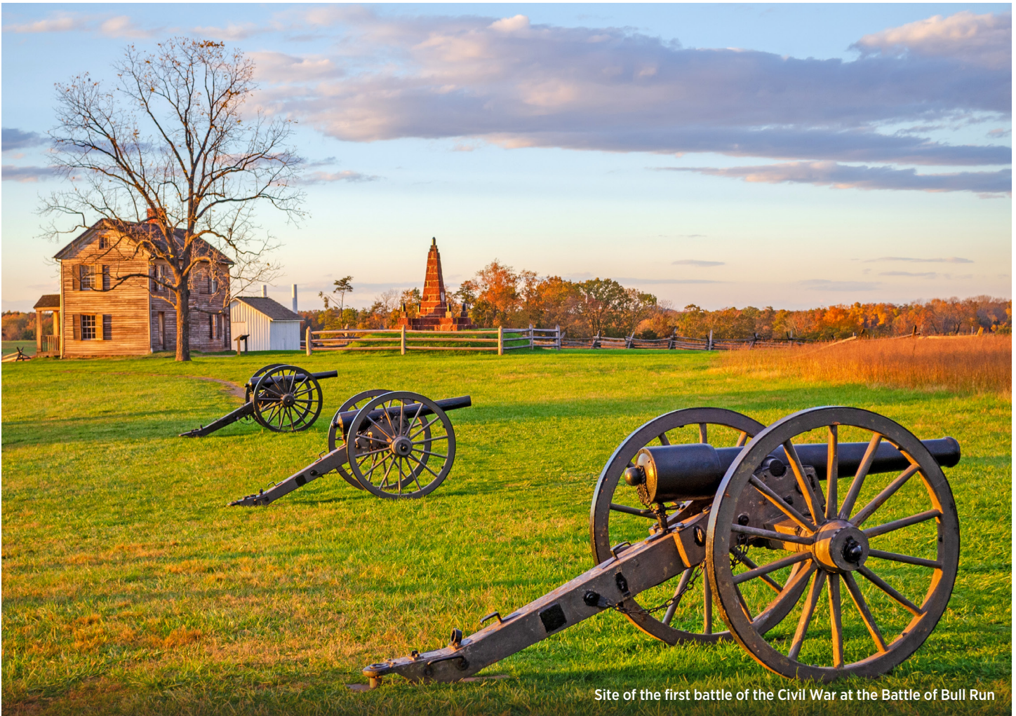
Site of the first battle of the Civil War at the Battle of Bull Run