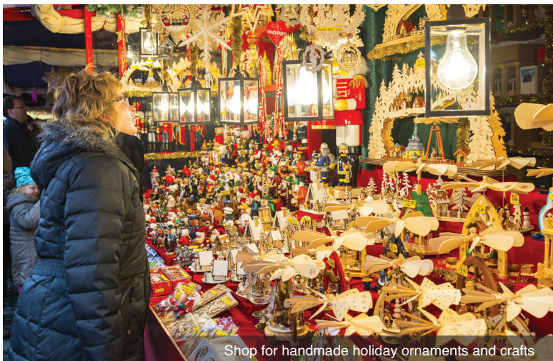
Shop for handmade holiday ornaments and crafts

Days 2 through 8 – Aboard an Emerald Cruises Star-Ship