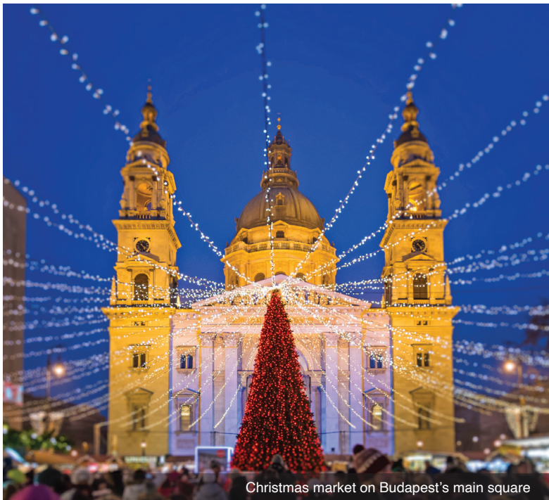
Christmas market on Budapest's main square

Parliament Building and travels along Andrassy Avenue – the main shopping area lined with spectacular Neo-Renaissance townhomes, cafés, boutiques and theaters, among them the State Opera House. This evening you'll be delighted by a traditional Hungarian folklore show onboard. Meals: B, L, D