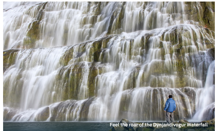
Feel the roar of the Dynjandivogur Waterfall

The itinerary is a guide only and may be amended for operational reasons. As such Mayflower & Scenic cannot guarantee the tour will operate unaltered from the itinerary stated above. Please refer to our terms and conditions for further information.