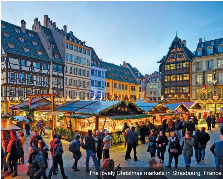
The lovely Christmas markets in Strasbourg, France

Heritage Site known for its medieval black and white timber-framed buildings, old tanning houses, baroque sandstone buildings, canals, and river locks, along with its centerpiece, the gothic cathedral. Enjoy free time to visit the stalls of Strasbourg’s Christkindelsmärik, one of the oldest in Europe, before returning to the ship. Enjoy local entertainment onboard this evening. Meals: B, L, D