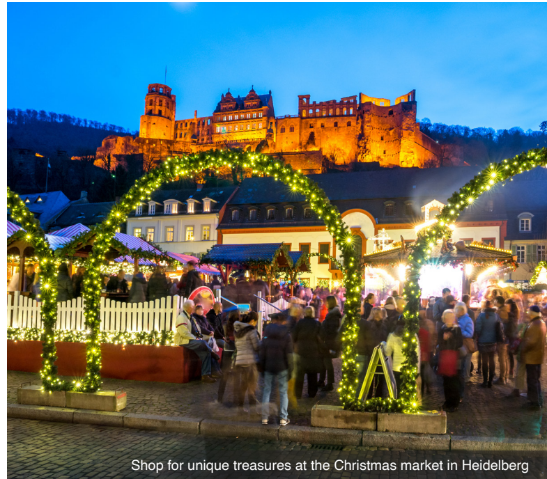
Shop for unique treasures at the Christmas market in Heidelberg

DAY 1 Depart the USA: Depart the USA on your overnight flight to Zurich, Switzerland.