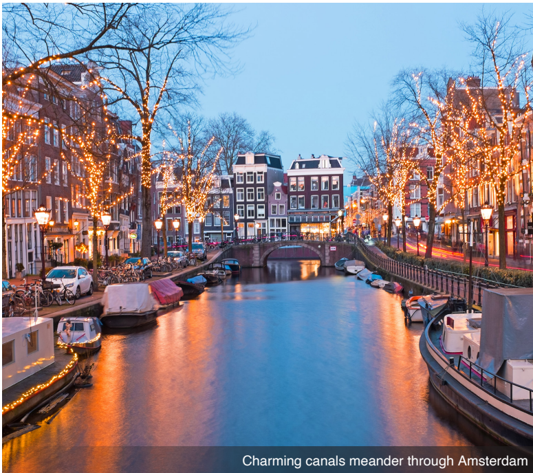
Charming canals meander through Amsterdam

EmeraldPLUS: Christmas traditions in Europe lecture onboard by the Cruise Director