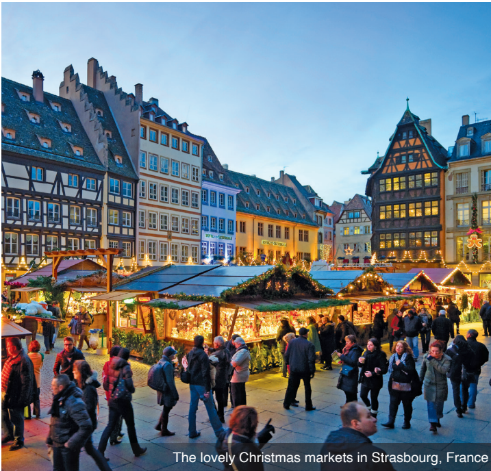
The lovely Christmas markets in Strasbourg, France