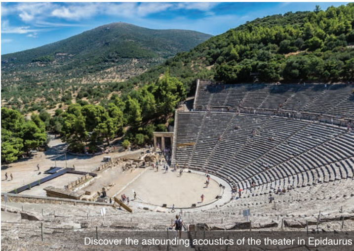
Discover the astounding acoustics of the theater in Epidaurus