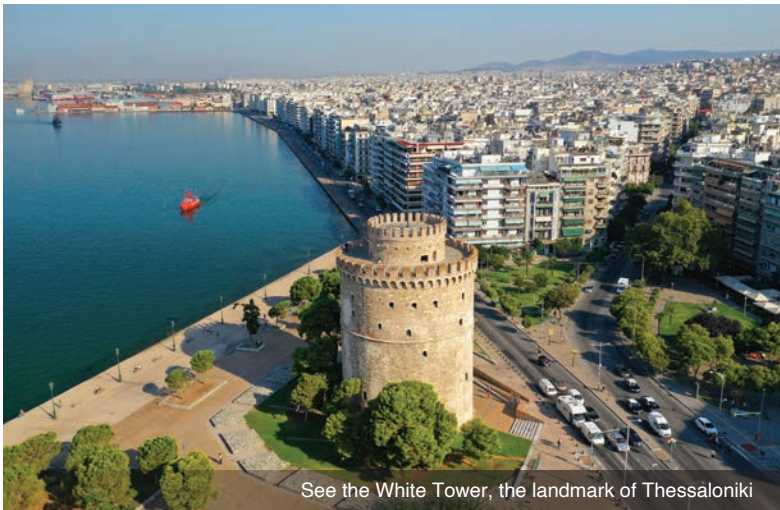
See the White Tower, the landmark of Thessaloniki

DAY 8 Delphi – Meteora – Thessaloniki: Journey to Thessaloniki, the second-largest city in Greece. Enroute, visit the breathtaking monasteries of Meteora, a UNESCO World Heritage Site. Perched on huge rock formations, they seem suspended between the earth and sky, creating a unique, surreal landscape and the perfect place to find spiritual peace. Of the initial twenty-four monasteries, only 6 remain active today. During the visit to 2 of these, priceless historical and religious treasures will be found inside. After the mystical visit to Meteora, continue to Thessaloniki and check in to the hotel. Meal: B