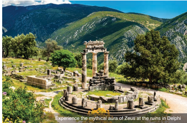
Experience the mythical aura of Zeus at the ruins in Delphi

DAY 1 Depart the USA: Depart the USA on your overnight flight to Athens, Greece.