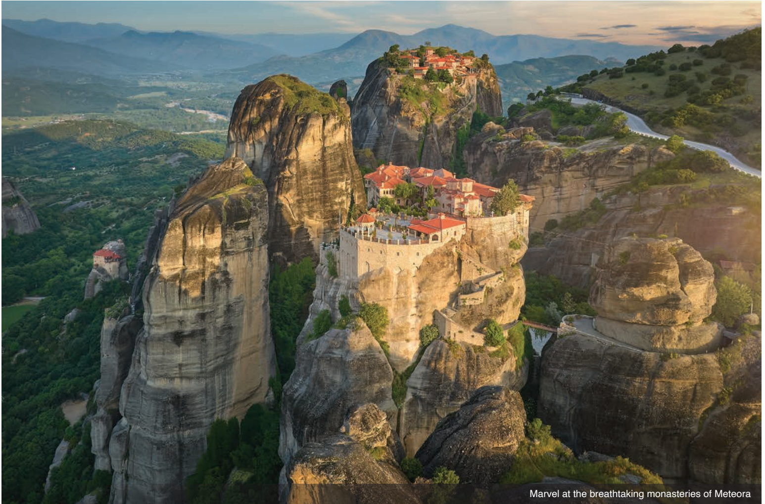
Marvel at the breathtaking monasteries of Meteora