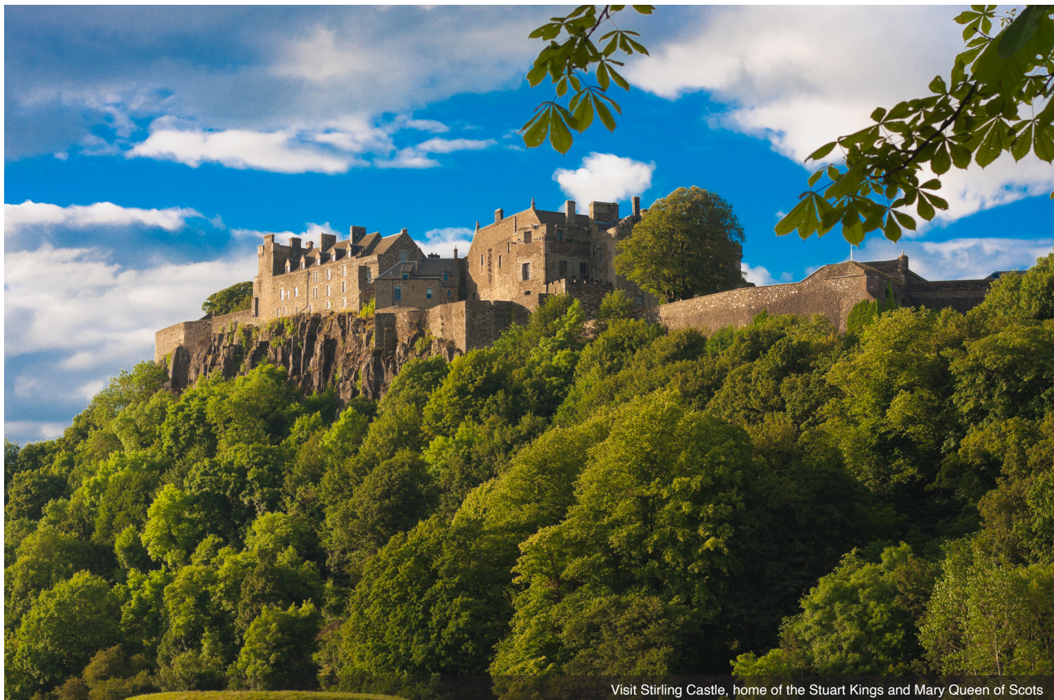
Visit Stirling Castle, home of the Stuart Kings and Mary Queen of Scots