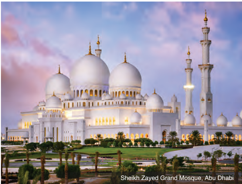
Sheikh Zayed Grand Mosque, Abu Dhabi

Sheikh Zayed Grand Mosque, one of the largest mosques in the world and an example of architectural styles from various Muslim civilizations. Featuring 82 domes, more than 1000 columns, 24-carat gold gilded chandeliers and the world’s largest hand-knotted carpet, this mosque is a place of worship and cultural diversity. At Heritage Village, travel back in time to experience what life was like in the past as you visit this reconstruction of a traditional oasis village. See local items being hand-crafted from pottery to glassblowing and weaving. The traditional Souk resembles a bustling trading hub of days gone by and offers an opportunity to purchase locally made souvenirs. Enjoy a photo stop at Emirates Palace, the opulent, luxury hotel and experience the local flavor of the country with a stop at the Date market to savor the many varieties of dates from the region. Lunch is included at a local restaurant during the day, and dinner is included at the hotel this evening. Meals: B, L, D