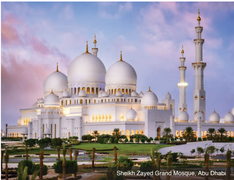
Sheikh Zayed Grand Mosque, Abu Dhabi

Sheikh Zayed Grand Mosque, one of the largest mosques in the world and an example of architectural styles from various Muslim civilizations. Featuring 82 domes, more than 1000 columns, 24-carat gold gilded chandeliers and the world’s largest hand-knotted carpet, this mosque is a place of worship and cultural diversity. At Heritage Village, travel back in time to experience what life was like in the past as you visit this reconstruction of a traditional oasis village. See local items being hand-crafted from pottery to glassblowing and weaving. The traditional Souk resembles a bustling trading hub of days gone by and offers an opportunity to purchase locally made souvenirs. Enjoy a photo stop at Emirates Palace, the opulent, luxury hotel and experience the local flavor of the country with a stop at the Date market to savor the many varieties of dates from the region. Lunch is included at a local restaurant during the day, and dinner is included at the hotel this evening. Meals: B, L, D