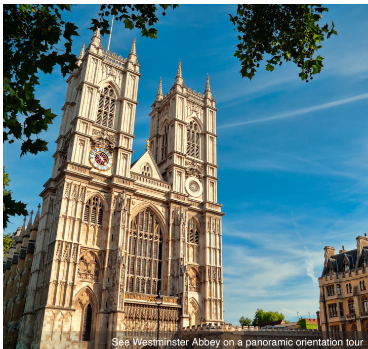
See Westminster Abbey on a panoramic orientation tour