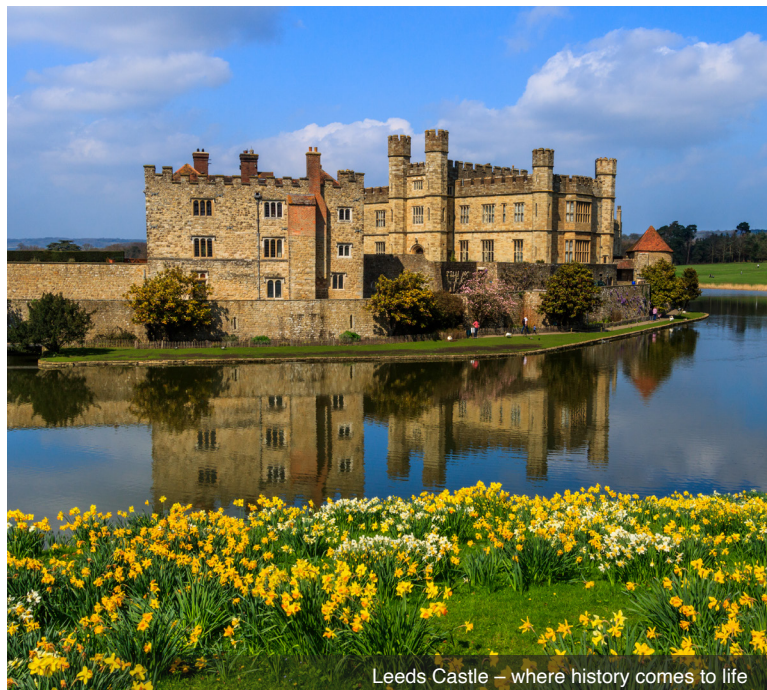
Leeds Castle – where history comes to life

DAY 1 Depart the USA: Depart the USA on your overnight flight to London, England.