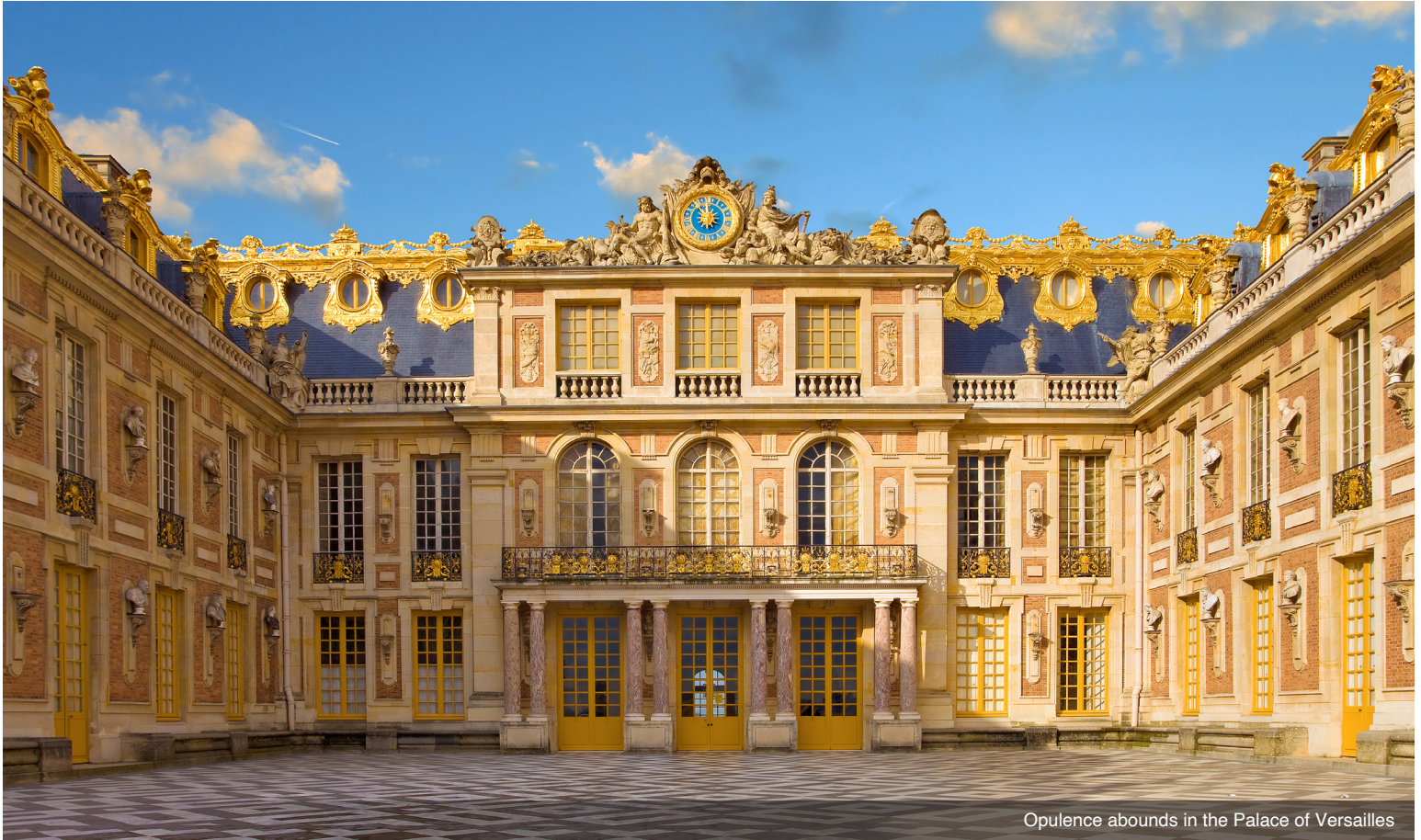
Opulence abounds in the Palace of Versailles