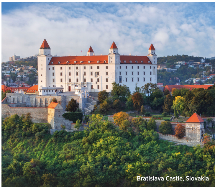
Bratislava Castle, Slovakia

most important Benedictine abbeys. Sitting atop a hill near Krems, this architectural treasure overlooks the spectacular Wachau Valley.