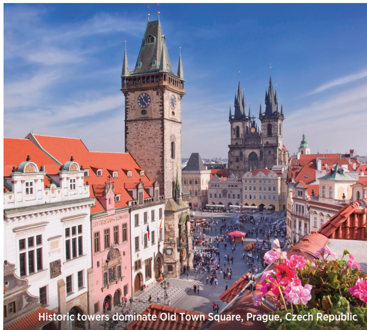
Historic towers dominate Old Town Square, Prague, Czech Republic

After breakfast, enjoy an included city tour, highlighting the famous sites of this beautiful city. Discover the heart of the city on foot, seeing Old Town Square with its historic astronomical clock and the medieval Charles Bridge. The tour concludes at the hotel. During free time this afternoon, continue to explore the city on your own, or join the optional excursion to the Terezin Concentration Camp. Meal: B