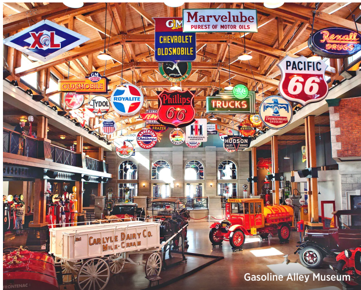
Gasoline Alley Museum

Get to know Calgary on a panoramic sightseeing tour of the city. Get your first glimpse of the Canadian Rockies from high atop the 626-foot tall Calgary Tower. Then, take a step back into Canada's colorful past at Heritage Park. Here you will learn about life as a 19th-century fur-trader or old-fashioned blacksmith.