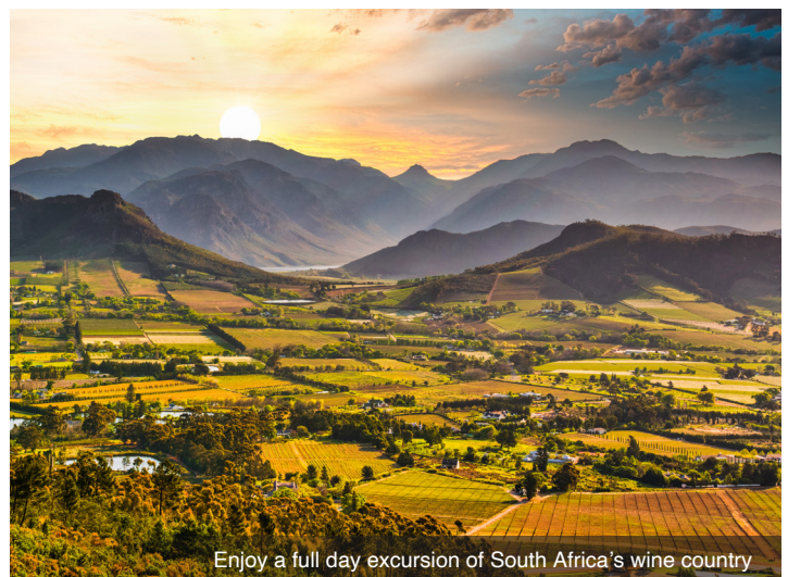
Enjoy a full day excursion of South Africa's wine country