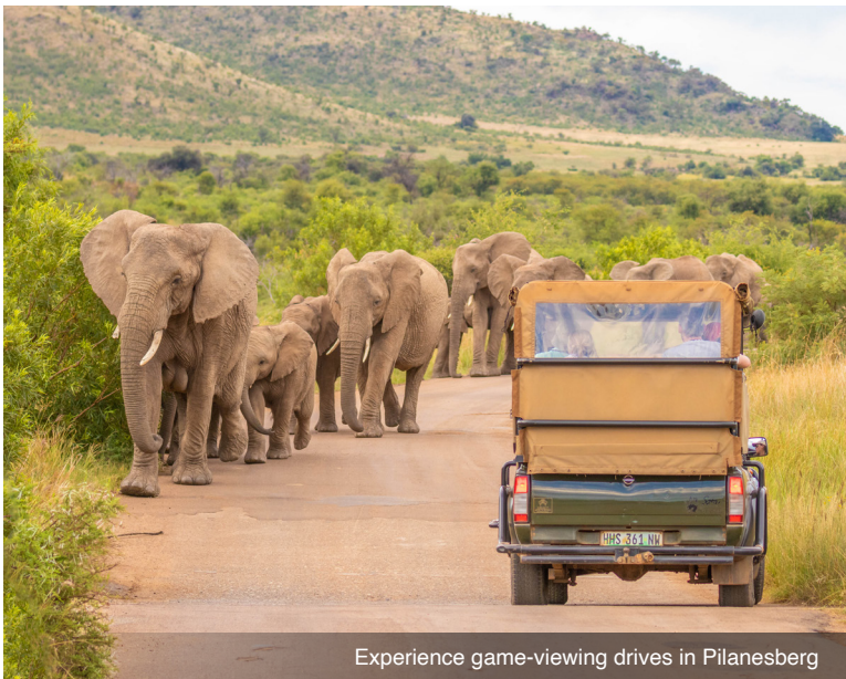
Experience game-viewing drives in Pilanesberg

arrival, journey by coach to Pilanesberg for the start of your safari adventures. Following lunch at the lodge, your first game drive takes place this afternoon as you traverse the reserve in open safari vehicles with your driver/guide. Return to the lodge after an exciting game drive and enjoy the included dinner this evening. Meals: B, L, D