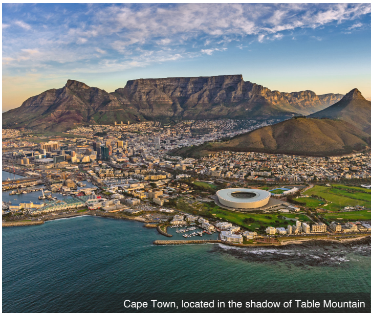
Cape Town, located in the shadow of Table Mountain