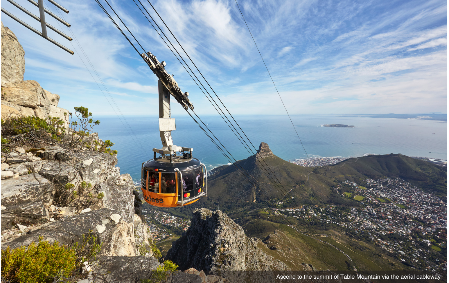
Ascend to the summit of Table Mountain via the aerial cableway