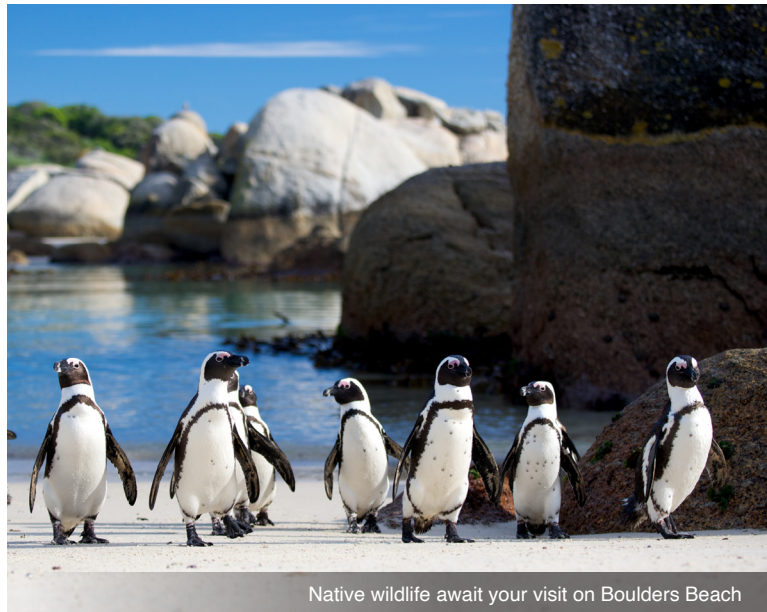
Native wildlife await your visit on Boulders Beach

DAY 1 Depart the USA: Depart the USA on your overnight flight to Cape Town, South Africa's oldest city.