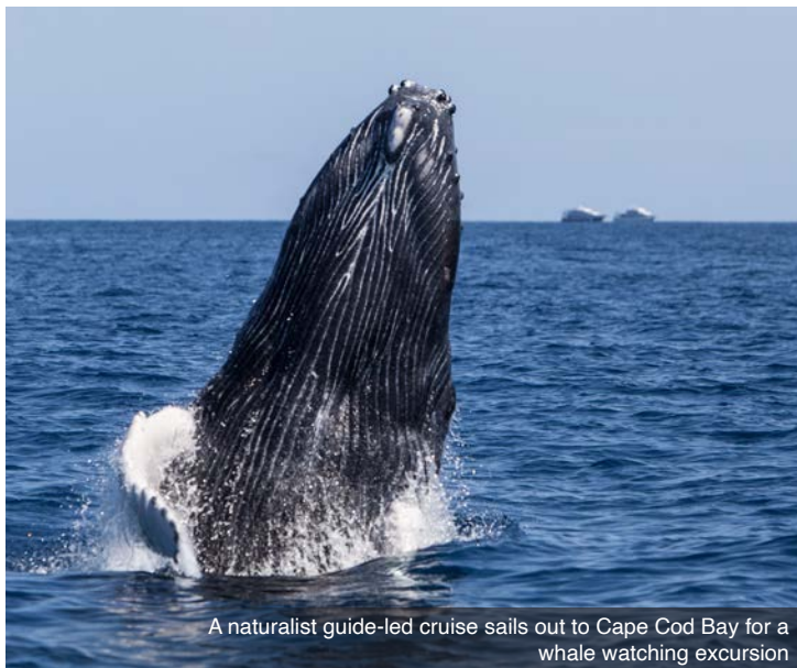
A naturalist guide-led cruise sails out to Cape Cod Bay for a whale watching excursion

DAY 9 Travel Home: This morning, take the group transfer to Boston's Logan Airport for flights out after 12:00 p.m. Meal: B