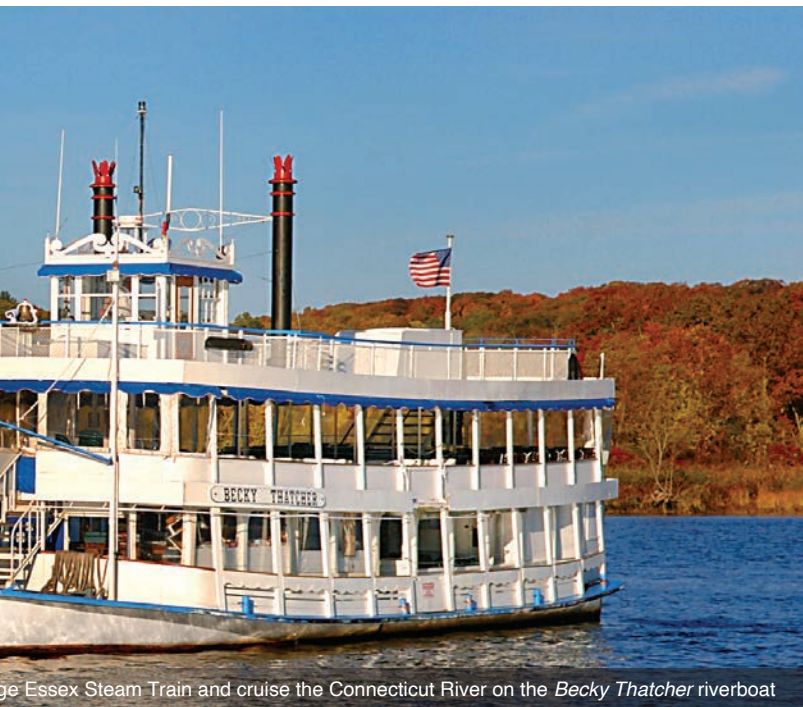
Essex Steam Train and cruise the Connecticut River on the Becky Thatcher riverboat

DAY 8 Plymouth Rock and Whale Watching Cruise: Today pass through the state of Rhode Island, famous for its maritime history. In Plymouth, Massachusetts climb aboard your sea going vessel for a whale watching excursion. This naturalist guide-led cruise sails out to Cape Cod Bay and Stellwagen Bank, a marine sanctuary and primary feeding ground for Humpback, Finback, Minke and the endangered Right Whales. Pay a visit to Plymouth Rock where our forefathers first settled on American soil. Tonight, gather for a farewell dinner hosted by your Tour Manager. Meals: B, D