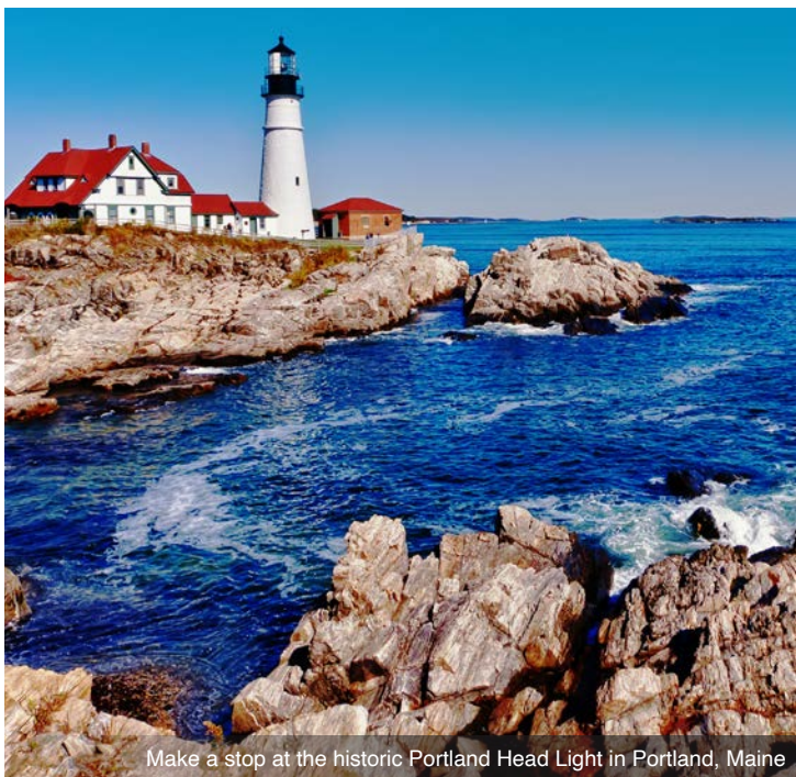
Make a stop at the historic Portland Head Light in Portland, Maine