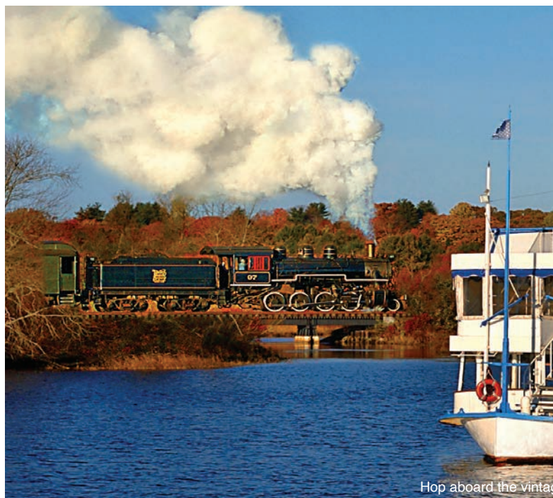
Hop aboard the vintage

DAY 1 Arrive in Boston: Arrive in Boston, Massachusetts with an included transfer to your hotel. Meet your Tour Manager in the hotel lobby at 6:00 p.m. for a welcome dinner. Meal: D