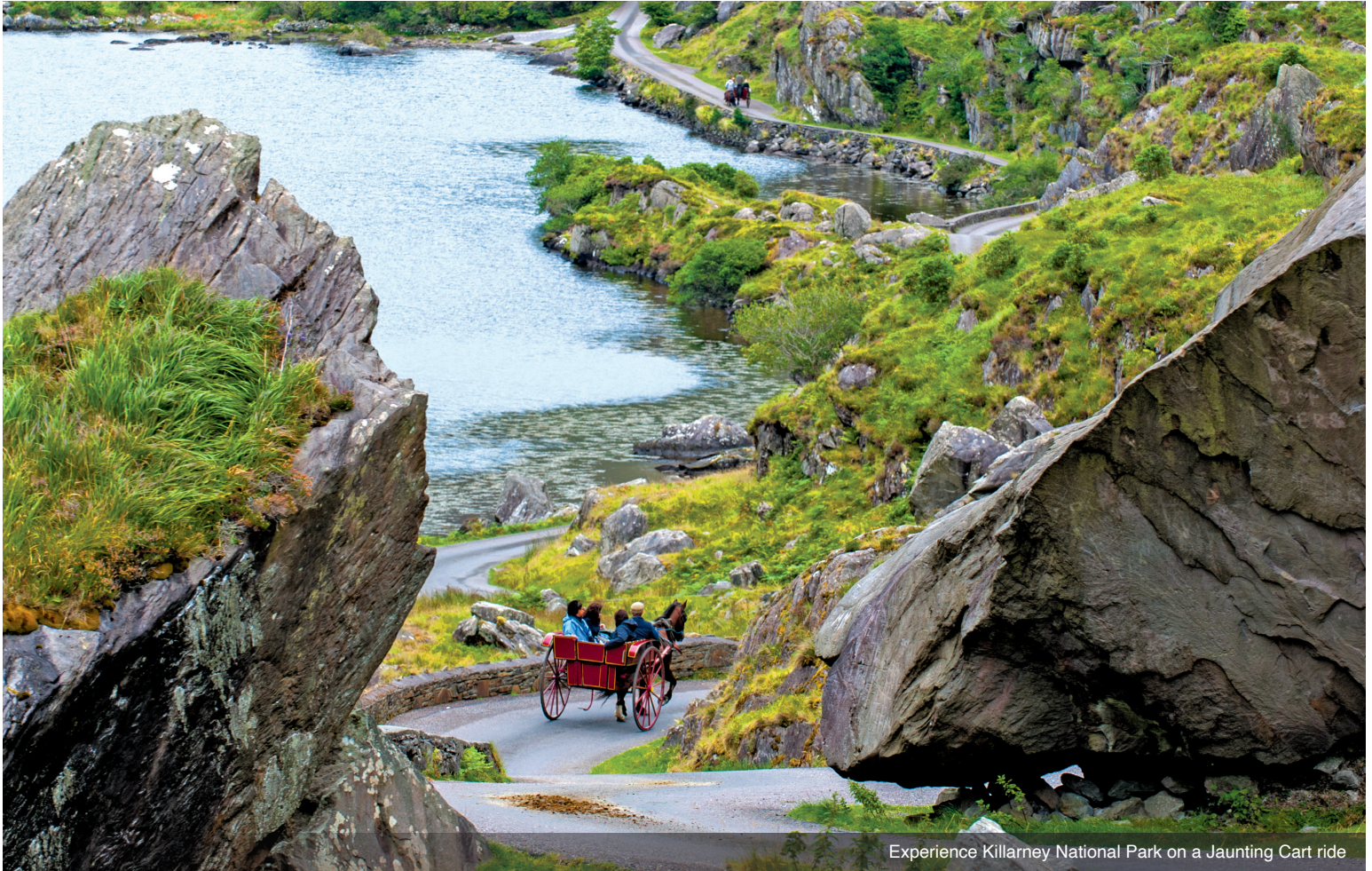
Experience Killarney National Park on a Jaunting Cart ride