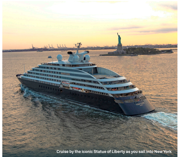
Cruise by the iconic Statue of Liberty as you sail into New York

Cruise past the iconic Statue of Liberty and the breathtaking Manhattan skyline as you cruise into