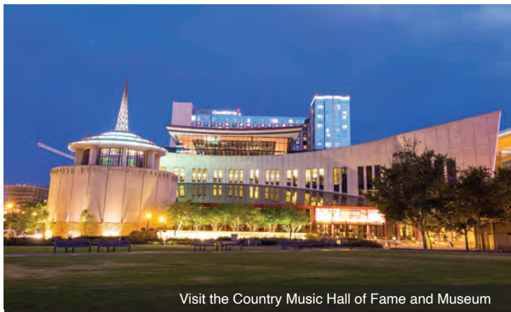
Visit the Country Music Hall of Fame and Museum

DAY 8 Travel Home: Following breakfast, a group transfer to the New Orleans International Airport is available for flights out after 11:00 a.m. Meal: B