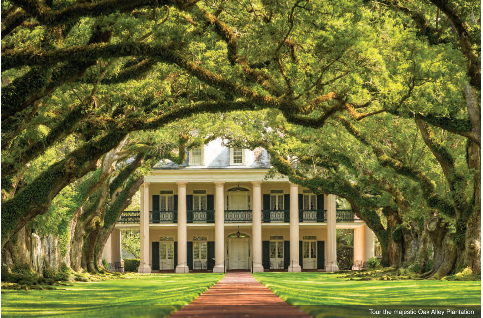
Tour the majestic Oak Alley Plantation