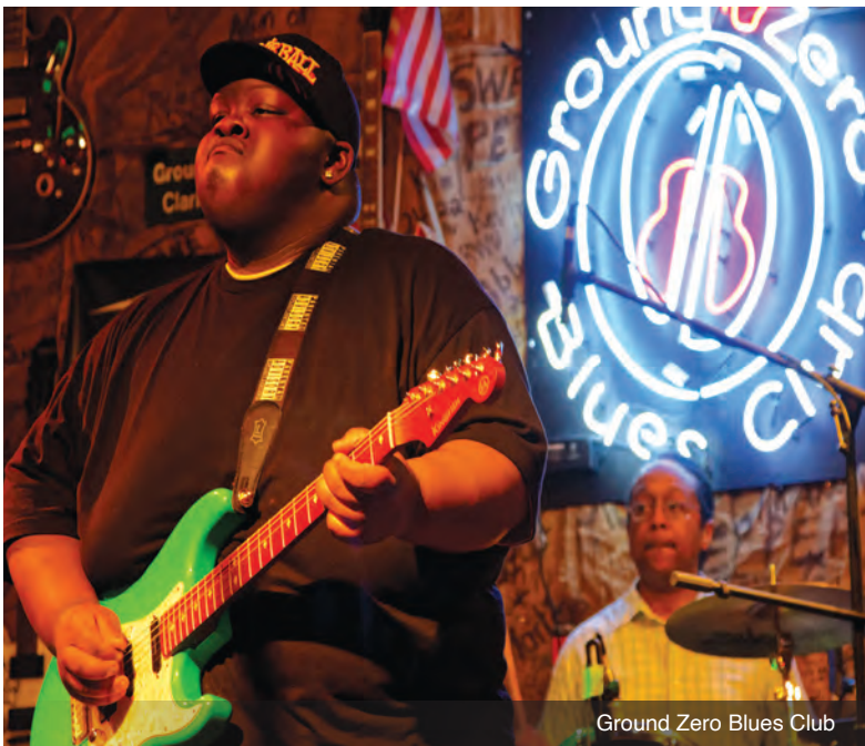
Ground Zero Blues Club

romance. Enjoy a tasty Mint Julep and take in the immense “alley” of 300-year-old live oak trees. Later, arrive in New Orleans for a two-night stay. Meal: B