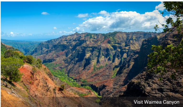
Visit Waimea Canyon