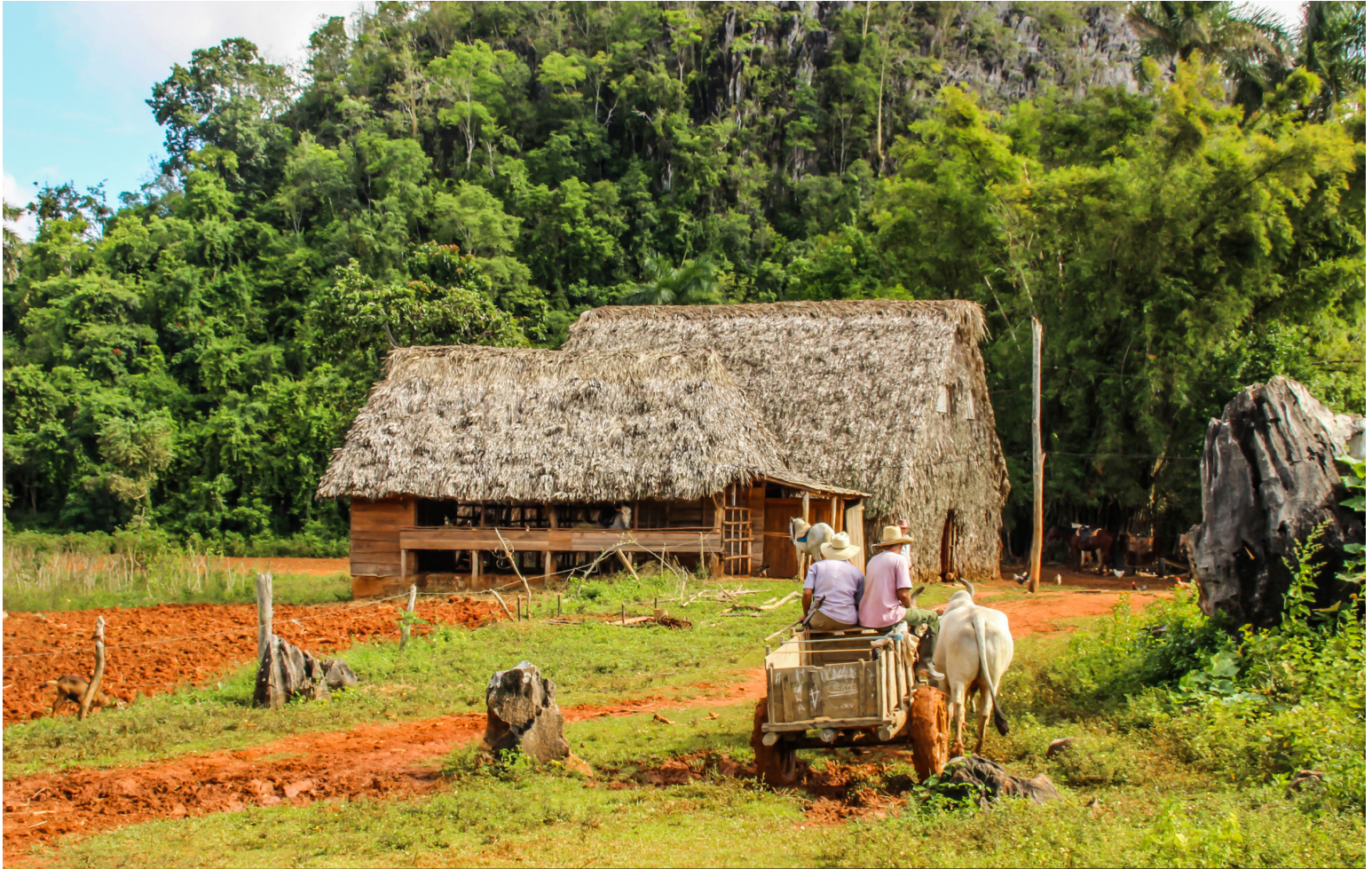
Visit Vista Hermosa, an agro-ecological farm project