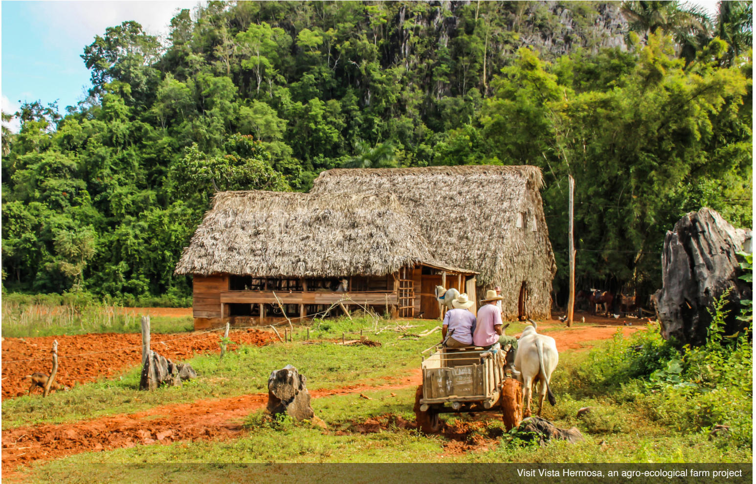
Visit Vista Hermosa, an agro-ecological farm project