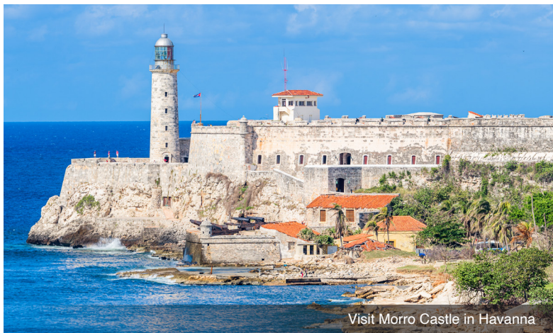
Visit Morro Castle in Havana

the heritage of Morro Castle. Next visit the neighborhood community project Muraleando, focusing on teaching skills to the younger generation. Meet with community artists and children who participate in visual arts, music and dance, hearing how these activities play an important role in changing their lives. See how a response to social hardship evolved into a thriving cultural center. Today's traditional lunch is prepared by members of the project Muraleando. While visiting a privately-run Cuban dance academy, talk with the professional instructors about the evolution of Cuban dance and learn the challenges of running private schools within Cuba's socio-economic landscape. Participate in a Salsa dance class to experience the local rhythm yourself! Dinner is at Al Carbón, a privately-run paladar in Old Havana, offering rustic elegance and wood-fired Cuban dishes. Learn about culinary innovation and entrepreneurship from the restaurant staff. Meals: B, L, D