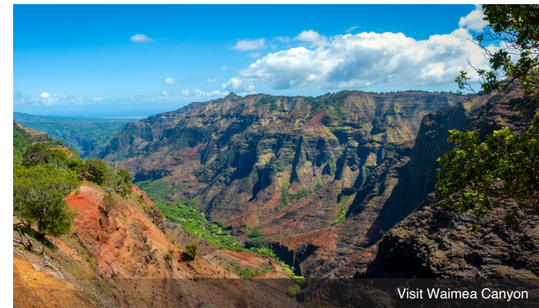
Visit Waimea Canyon