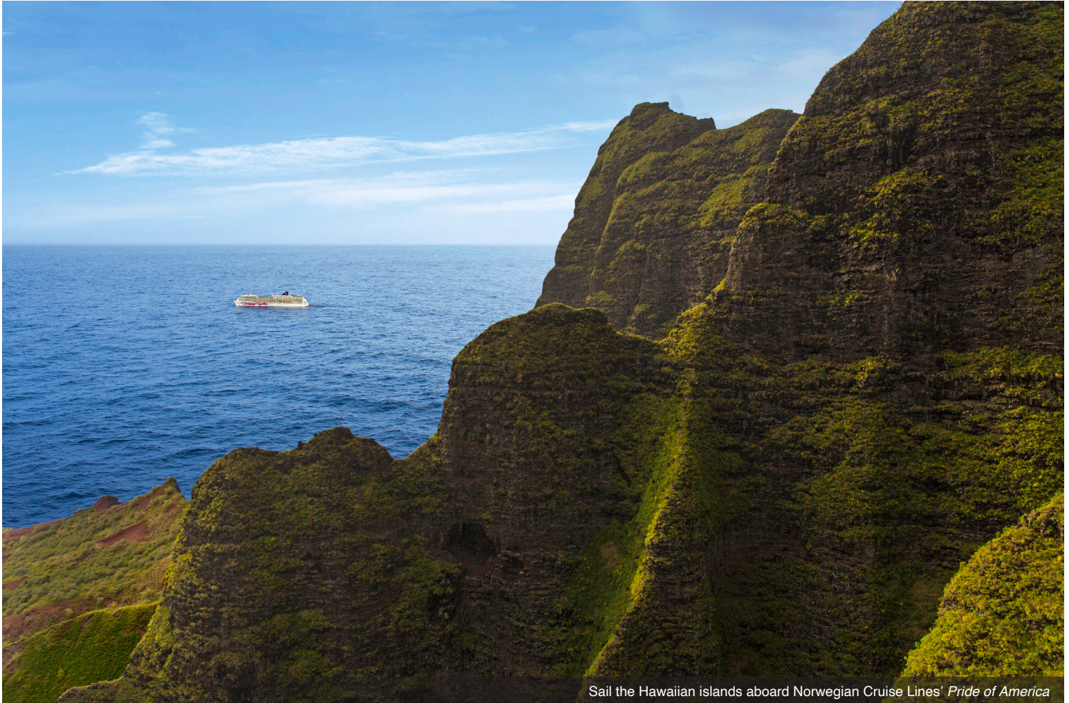
Sail the Hawaiian islands aboard Norwegian Cruise Lines' Pride of America