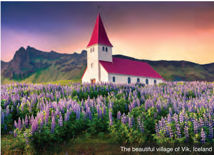
The beautiful village of Vik, Iceland