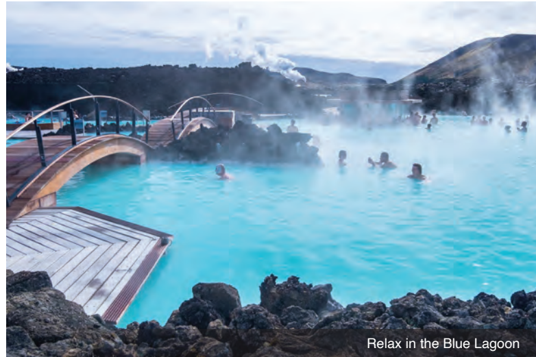
Relax in the Blue Lagoon

DAY 1 Depart the USA: Today you'll depart the USA on your overnight flight to Keflavik, Iceland.