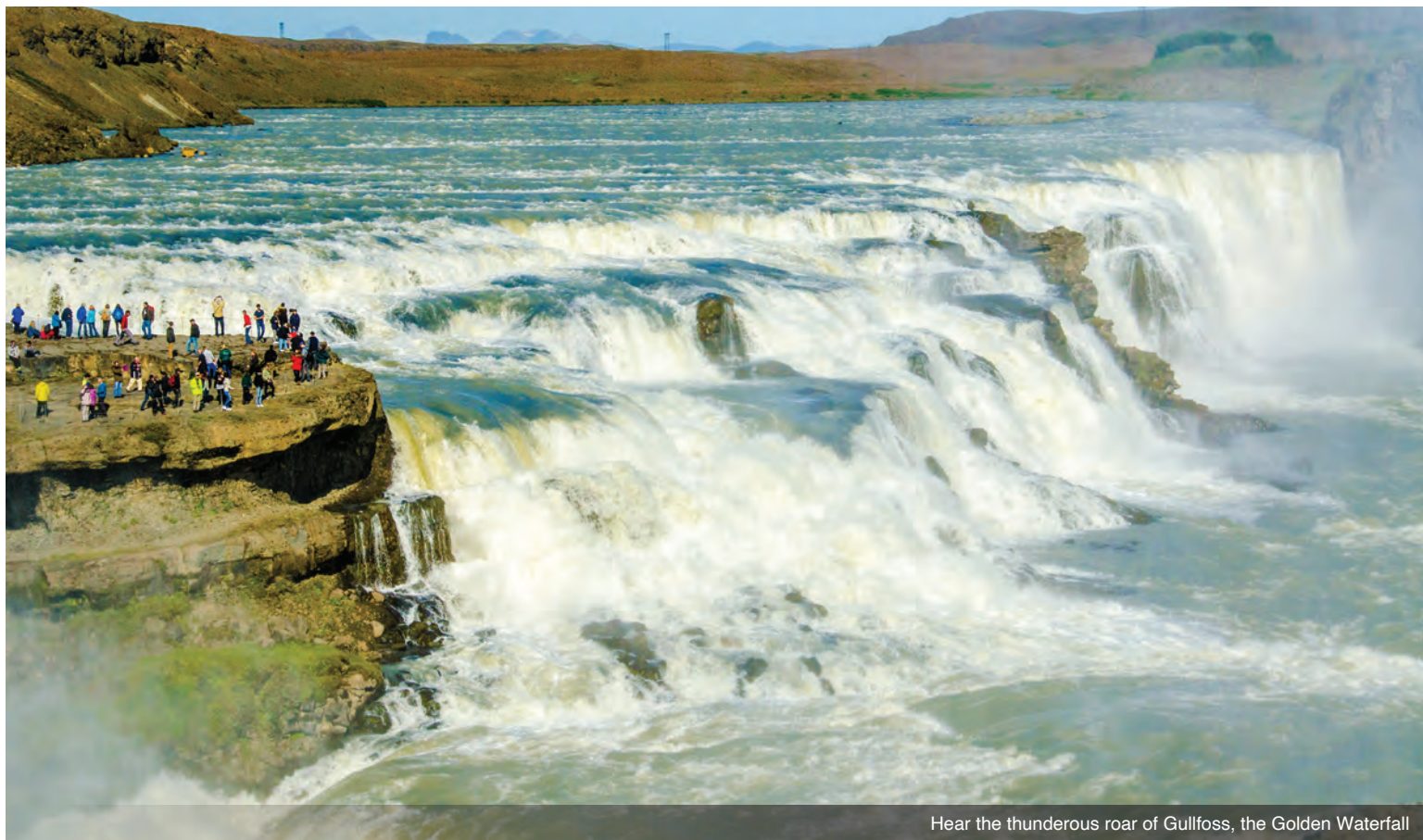
Hear the thunderous roar of Gullfoss, the Golden Waterfall