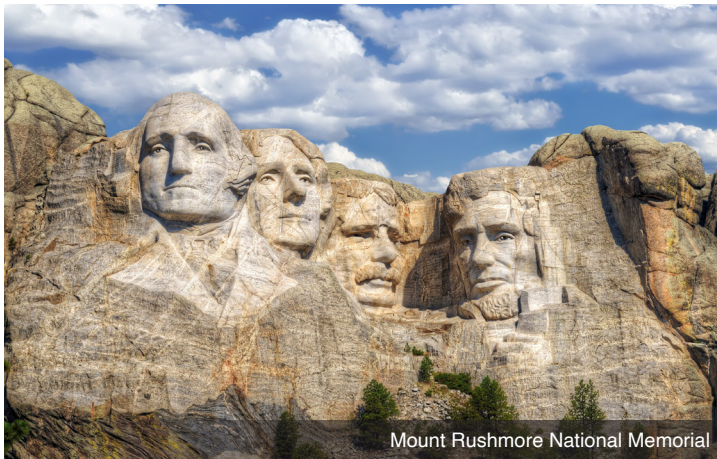
Mount Rushmore National Memorial

DAY 6 Travel Home: After breakfast, a group transfer to the Rapid City airport is available for flights out after 10:00 a.m. Meal: B