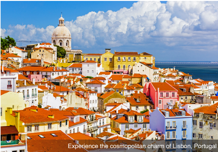
Experience the cosmopolitan charm of Lisbon, Portugal