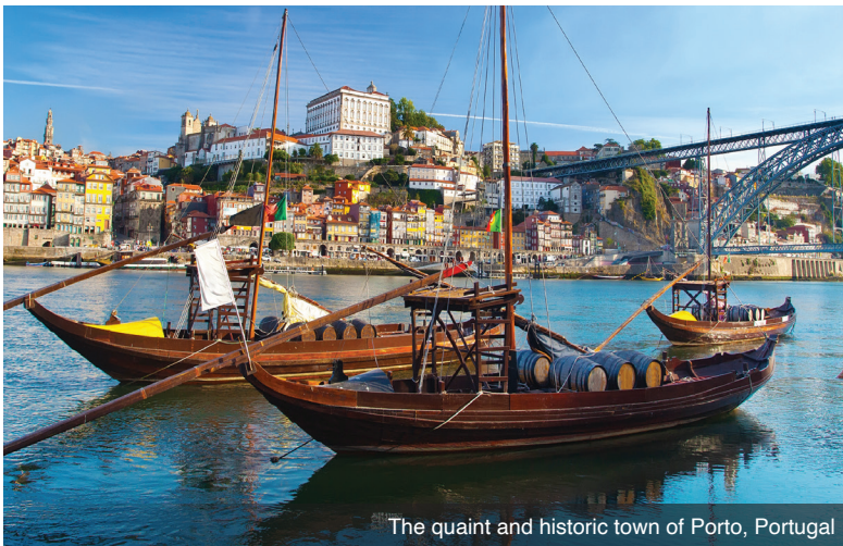
The quaint and historic town of Porto, Portugal

pilgrimage sites in Portugal. Visit the Sanctuary perched atop the hill, with its iconic 686-step granite staircase, decorated with the traditional Portuguese blue and white 'azulejos' tiles. This afternoon, experience a rural lunch at Quinta da Pacheca, one of the finest estates along the Douro River. Return to the ship in Régua after the excursion. This evening, enjoy local entertainment onboard. Meals: B, L, D