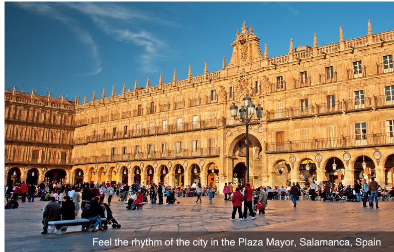
Feel the rhythm of the city in the Plaza Mayor, Salamanca, Spain

DAY 1 Depart the USA: Depart the USA on your overnight flight to Lisbon, Portugal.