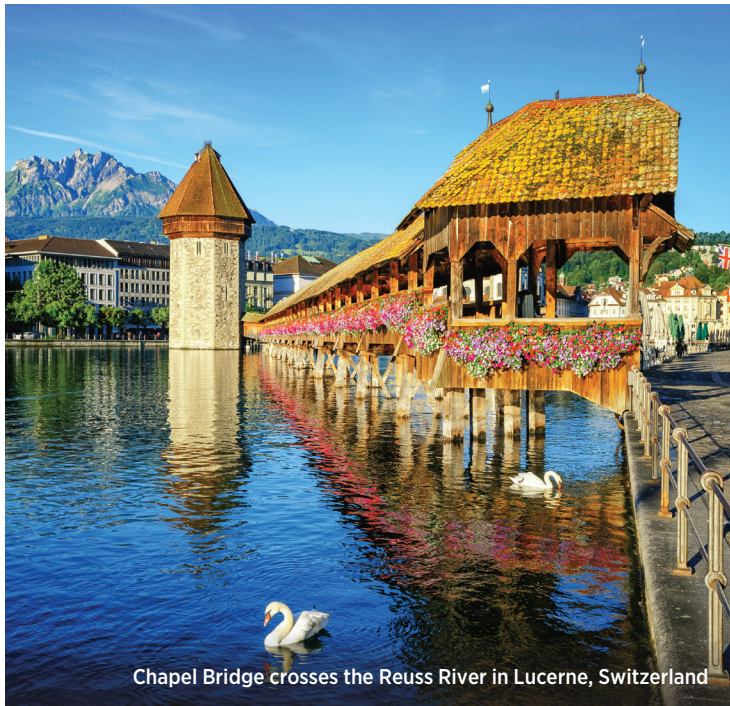
Chapel Bridge crosses the Reuss River in Lucerne, Switzerland