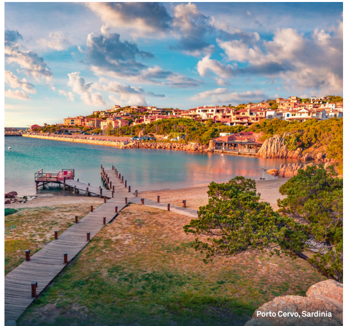
Porto Cervo, Sardinia

Nestled in the heart of Sardinia's Costa Smeralda, this paradisiacal town blends romantic, traditional architecture with vibrant Mediterranean beauty. Built as a millionaire's playground by Prince Aga Khan in the 1960s, Porto Cervo oozes luxury with high-end boutiques, stylish restaurants, glamorous nightclubs, world-class golf courses, sumptuous hotels and golden beaches. Very few passenger ships visit Porto Cervo, so you could have this chic town all to yourself, but look out for celebrities on the waiting superyachts or strolling the streets. Meals: B. L. D.