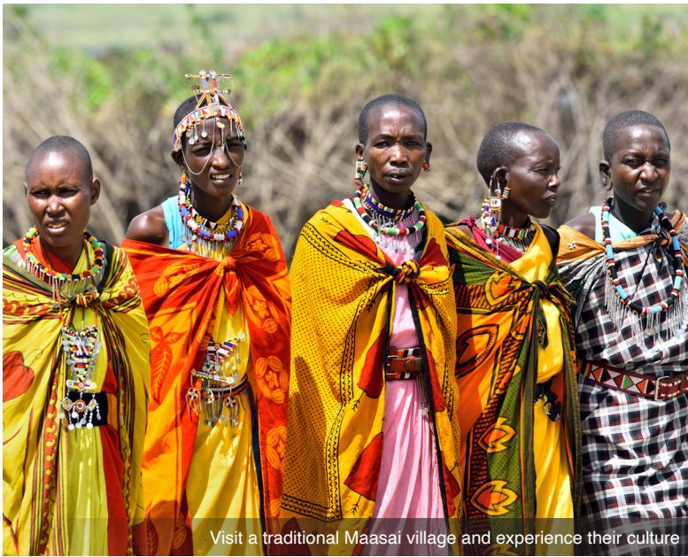
Visit a traditional Maasai village and experience their culture

Rift Valley. Relish in the surrounding sights and sounds of the native wildlife. Beautiful birds along the banks, in the trees, and soaring above; lazy hippos yawning as they emerge from the water; African Fish Eagles swoop down to snatch a fish from the lake for dinner...it all awaits! Check in to the lodge and enjoy a relaxing evening. Meals: B, L, D