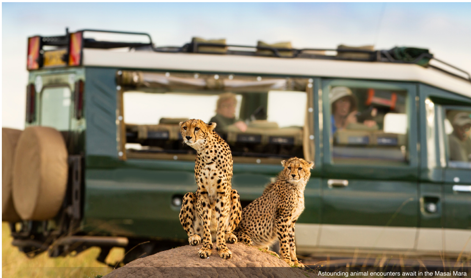
Astounding animal encounters await in the Masai Mara