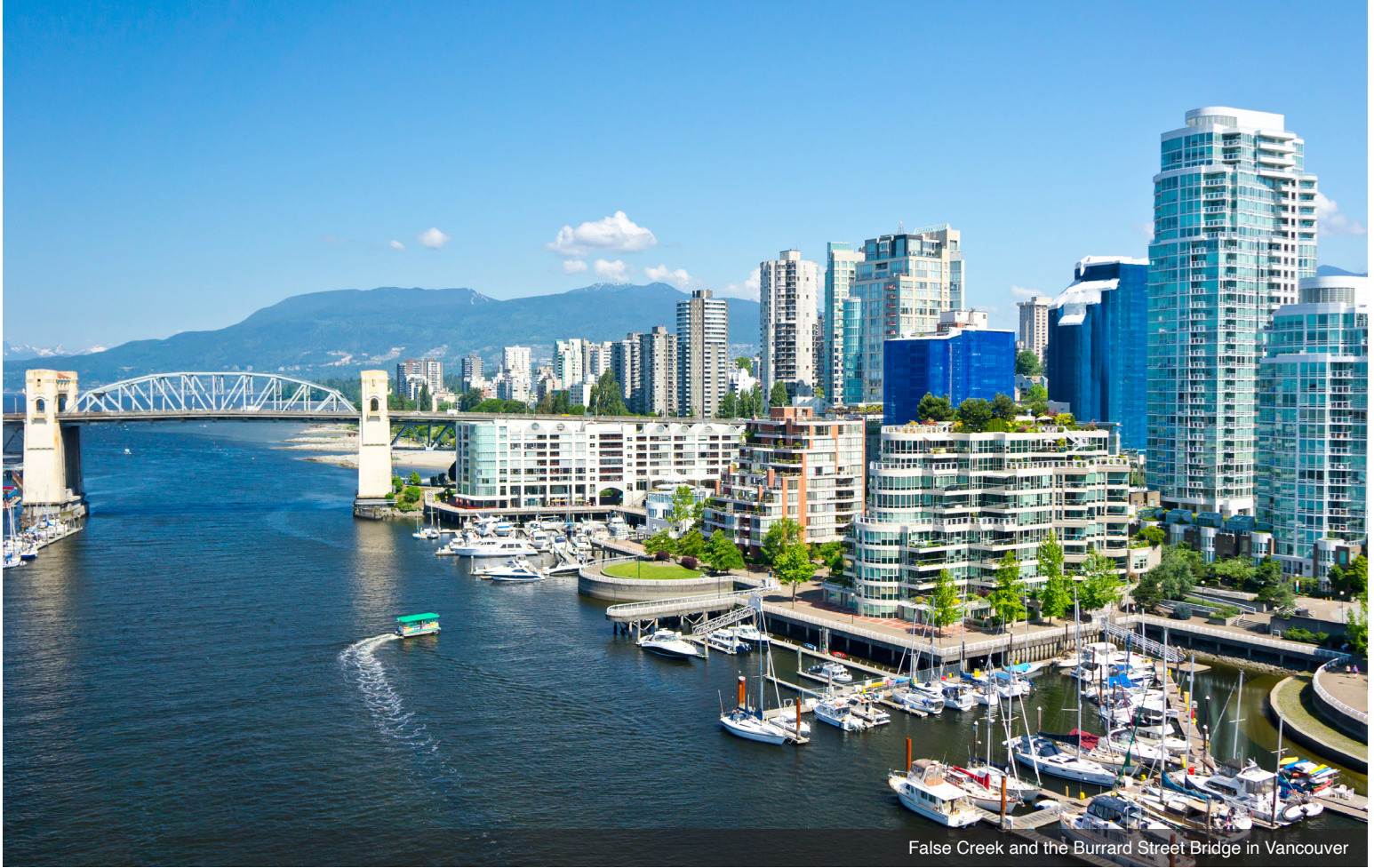
False Creek and the Burrard Street Bridge in Vancouver