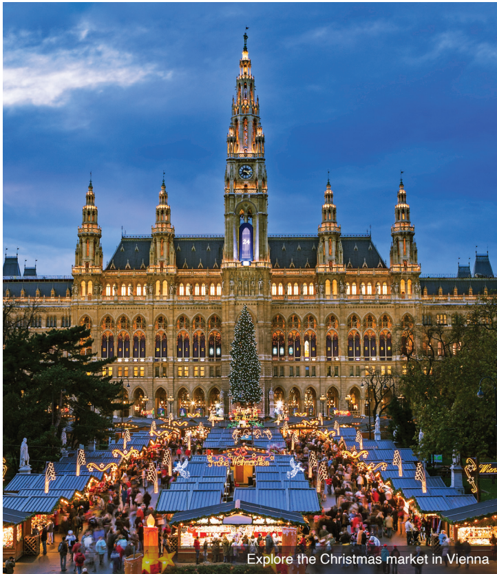
Explore the Christmas market in Vienna