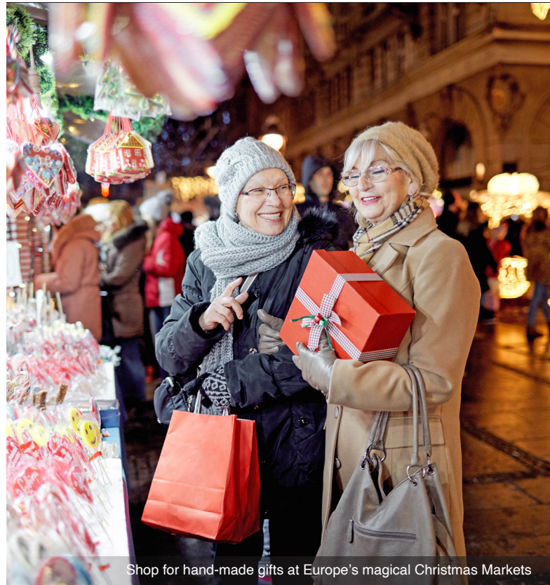
Shop for hand-made gifts at Europe's magical Christmas Markets

DAY 1 Depart the USA: Depart the USA on your overnight flight to Vienna, Austria.